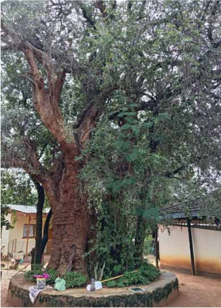
Motlhware wa ga Kgosi Makaba II oo dingwaga di fetang lekgolo, o bonwa mo kgotleng ya Sebako kwa Kanye. Ke setlhare se se nang le ditso tsa bogosi jwa Bangwaketse.

le tshireletsego ya morafe, o supile gore go dumelwa fa mokgalo o seke o rathwa ke tladi ka jalo ba leba mokgalo e le thebe ya setshaba.