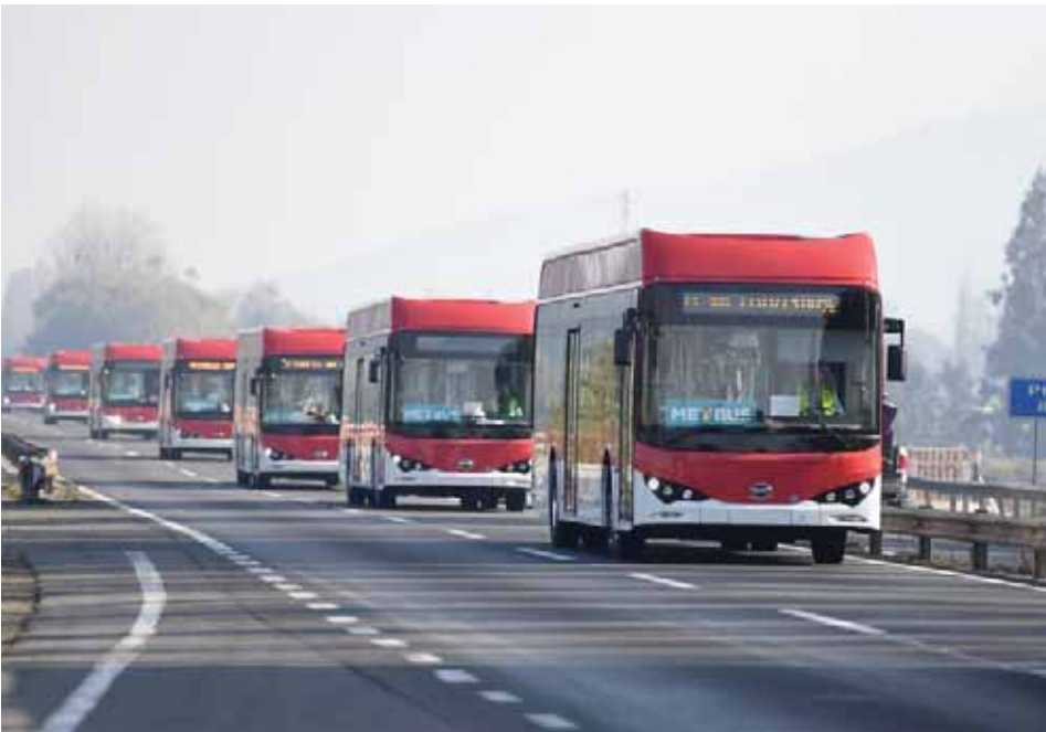
SANTIAGO - Electric buses manufactured by Chinese company BYD heading for Santiago from the Port San Antonio in Chile. The buses have significantly reduced air and noise pollution.