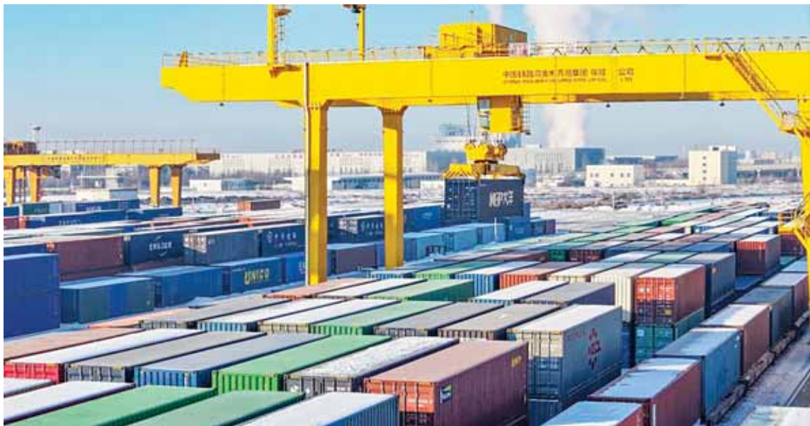
URUMQI - A view of the load-transfer yard of Horgos railway port in Horgos. Northwest China’s Xinjiang Uygur Autonomous saw its foreign trade expand 15.4 per cent to a total of ¥108.16 billion (around US$15 billion) in the first quarter of 2025, according to data from customs authorities. During the period, the autonomous region’s exports hit ¥95.17 billion, while imports reached ¥12.99 billion, Urumqi Customs said.

Meanwhile, Kenyan agricultural products, ranging from avocados to tea, are appearing more frequently on Chinese dining tables. Xinhua