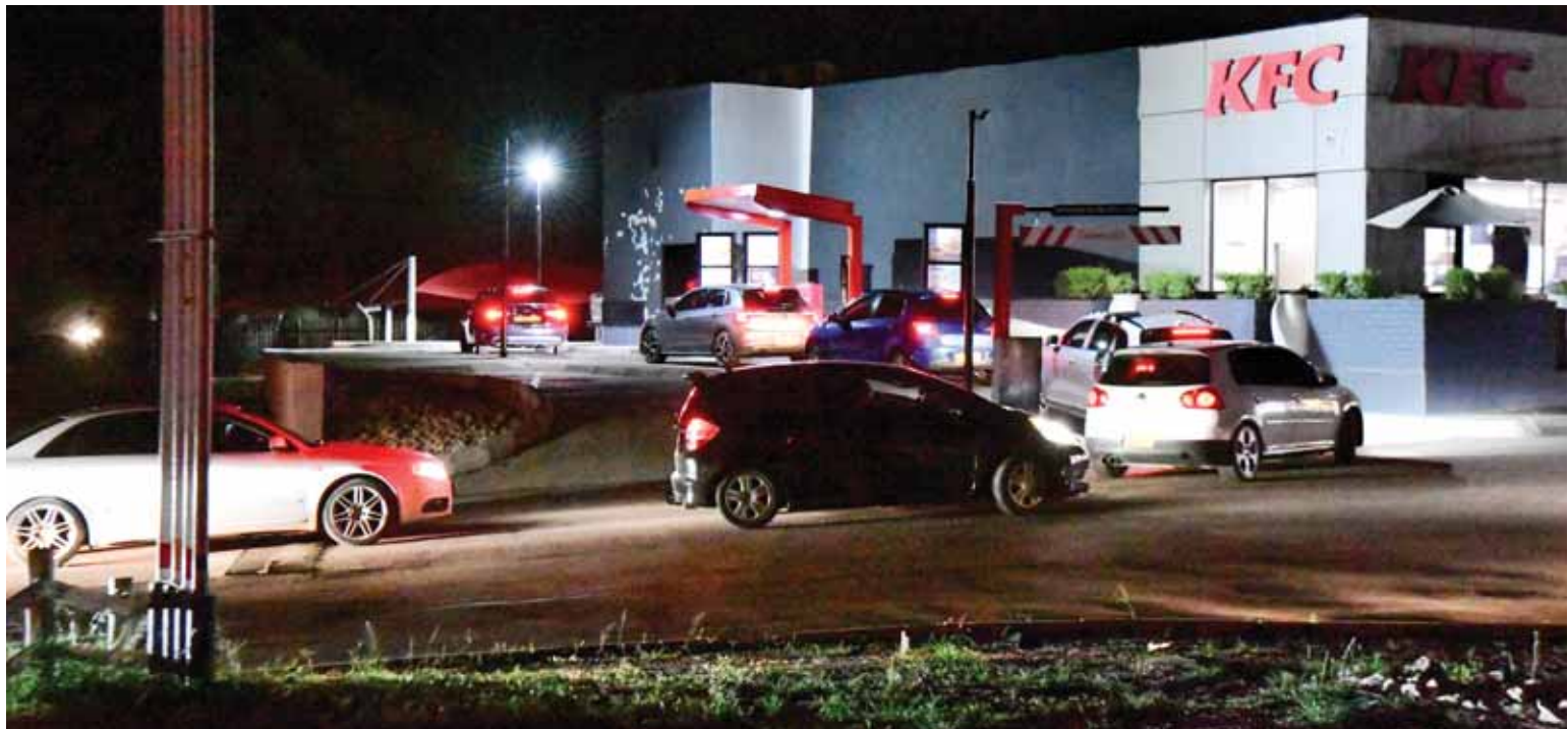
Cars queuing for fast food takeaways at a KFC drive-thru during an evening of load shedding in Gaborone recently. A press release from Botswana Power Corporation says load shedding activities have ceased effective immediately. It says the positive development follows the successful synchronisation of the third of the four generation units at Morupule B Power station, significantly increasing local generation capacity to 390MW and enhancing the overall power situation. The release goes to say the achievements are substantially augmented by the successful bilateral engagement between Botswana and South Africa on energy security facilitated by Minister of Minerals and Energy, Ms Bogolo Kenewendo.

cautious economic and business environment, urging countries to negotiate and engage in dialogue on trade issues. Xinhua