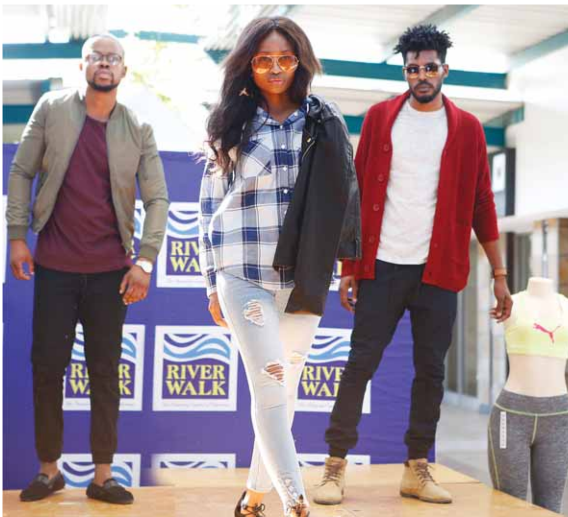
Models showcasing designs at a previous Madam Queen Winter Fashion Show in Gaborone. The modelling agency, in conjunction with Riverwalk Mall, CB Stores and Topline, will on Saturday host the 2025 Winter Fashion Show.