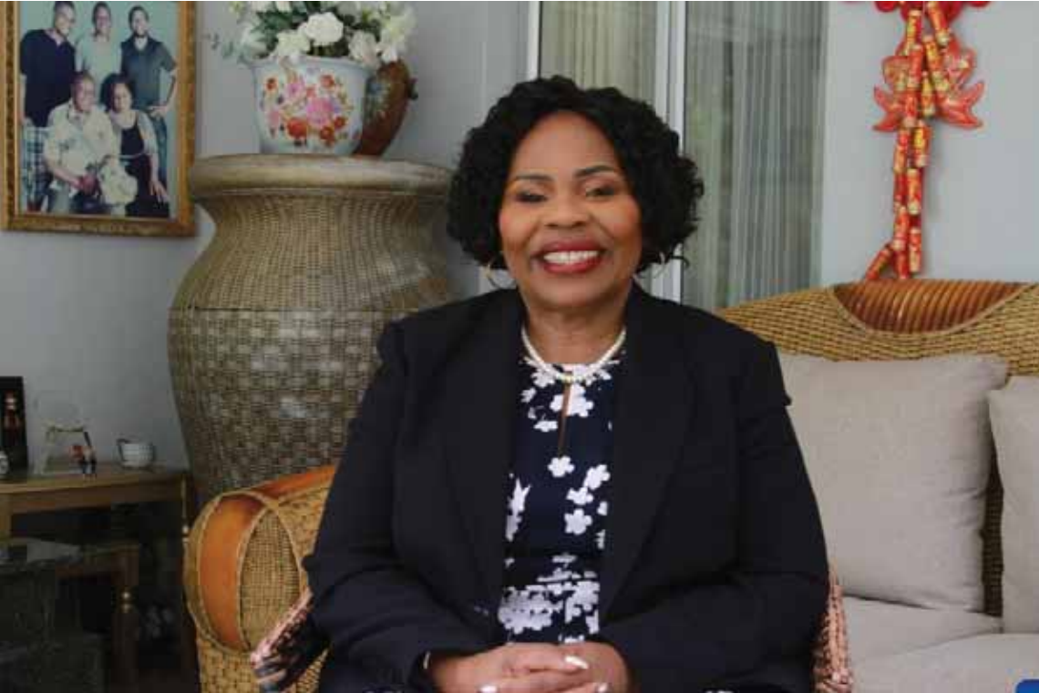
HARARE - Zimbabwe's minister of women affairs, community, small and medium enterprises development, Monica Mutsvangwa, said ties between Zimbabwe and China continued to deepen 45 years after diplomatic relations were established. She said the enduring friendship between the two sides had yielded positive results in Zimbabwe's social and economic development.

in improving the global environmental situation and provide collaborative solutions to protect the planet for future generations. "On this Earth Day, I urge all South Africans to join in protecting our environment. Whether through reducing waste, conserving water or supporting sustainable policies, every action matters. Together, we can ensure that South Africa's natural heritage thrives for generations to come," said George. Xinhua