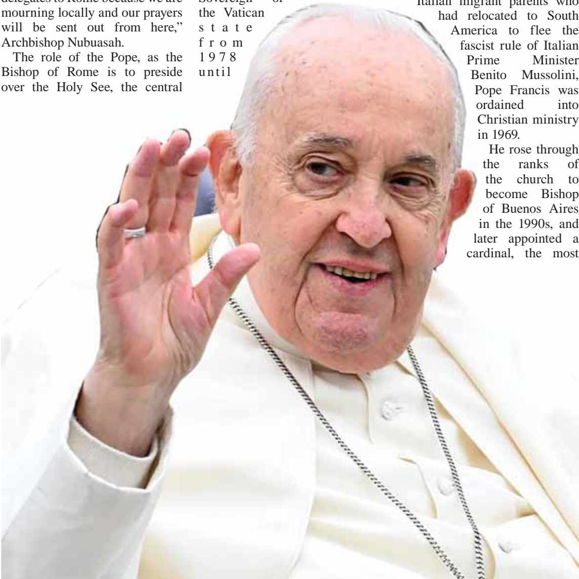
ROME - Pope Francis at an event at St Peter’s Square in the Vatican. Pope Francis died on Monday at the age of 88. Born as Jorge Mario Bergoglio on December 17, 1936, in Buenos Aires, he had served as the head of the Roman Catholic Church since 2013.