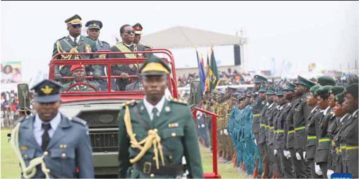
GOKWE - Zimbabwe president Dr Emmerson Mnangagwa in a military vehicle during a military display marking the Independence Day in Midlands Province, Zimbabwe on Friday. He led the nation in marking the country’s 45 th independence anniversary, expressing his gratitude for the liberation and post-independence efforts to develop and modernise Zimbabwe.

incidents on aging structures, non-compliance with building regulations, and the use of substandard construction materials. Xinhua