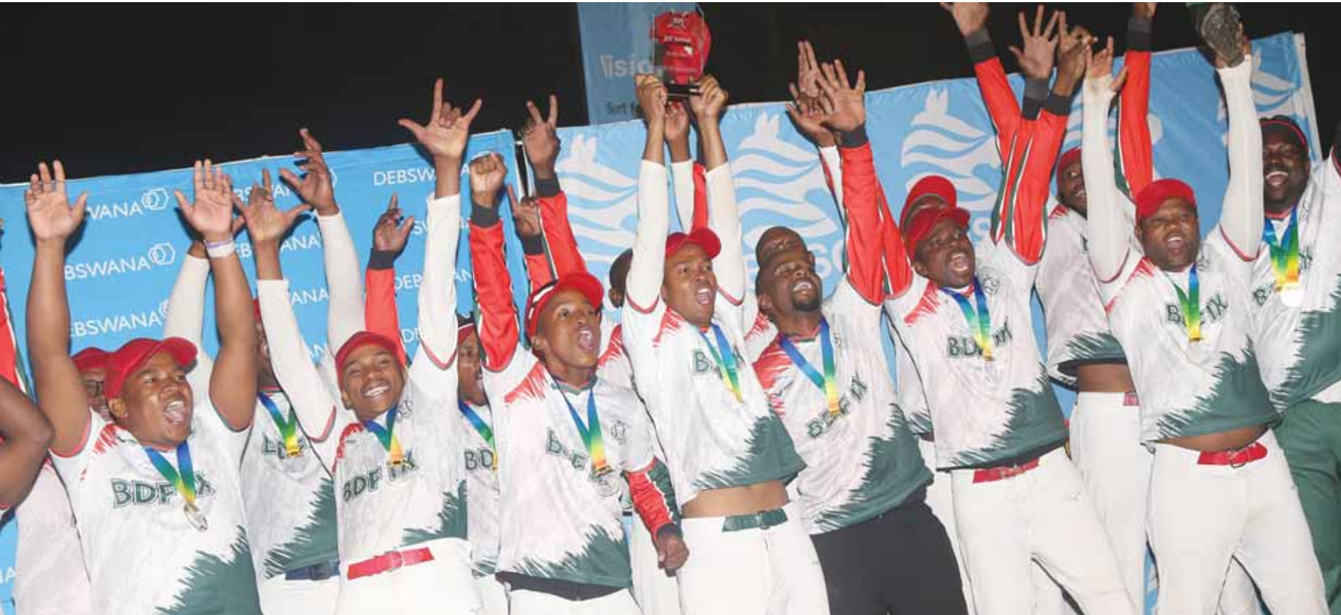
BDF IX men's team in a jubilant mood following their victory in the 2025 BSA Championship tournament in Jwaneng. BDF edged out Gatalamotho with a narrow 2-1 victory.