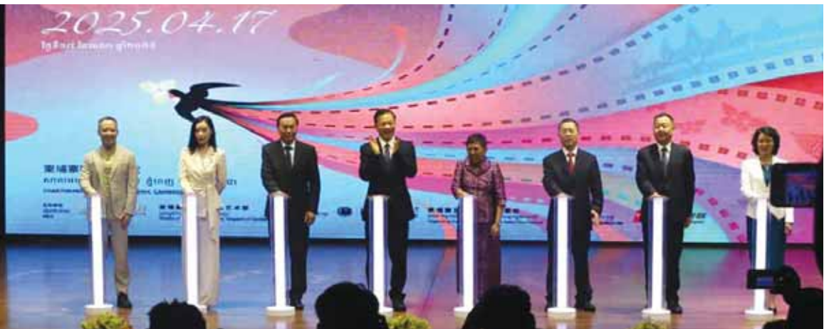
PHNOM PENH - The Chinese Film Week, which opened with the animated film I Am What I Am 2 on Thursday ended yesterday.