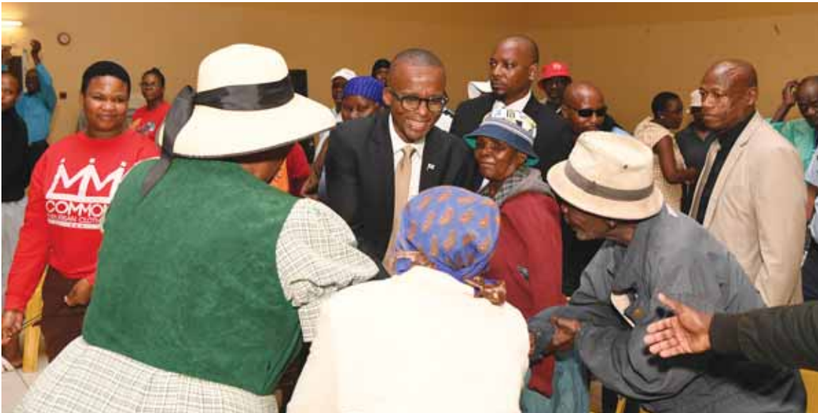
Vice President and also Bonnington South MP, Mr Ndaba Gaolathe (centre) with Morula residents in Gaborone West recently. Mr Gaolathe emphasised the urgent need to improve water delivery systems to support agricultural growth.

Reflecting on Botswana’s history of unity and resilience, Mr Gaolathe encouraged Batswana to draw strength from their shared values and collective spirit. “Together, we will shape Botswana we want, a Botswana that future generations will be proud to call home,” he said.