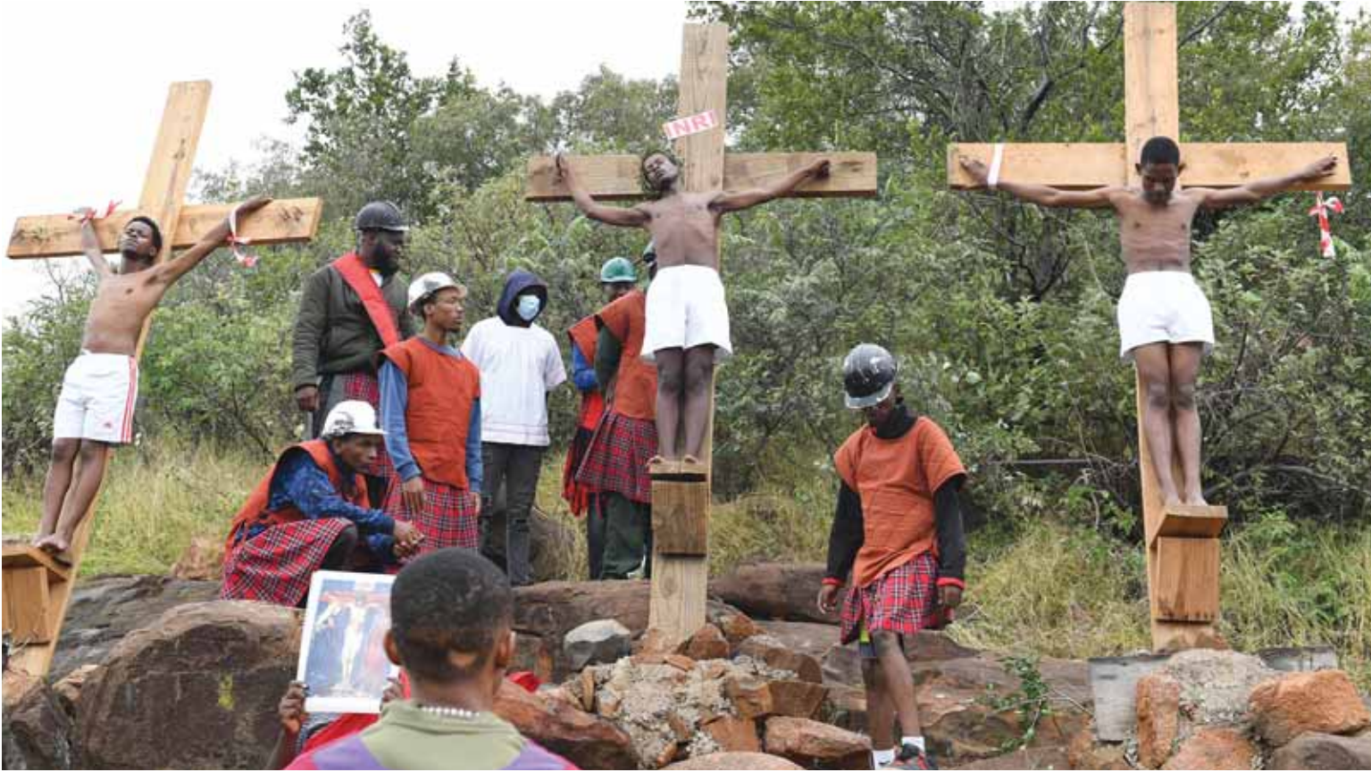
Members of St Bernadette and Krete Lefika Catholic Church performing a drama depicting events that led to Jesus Christ of Nazareth’s death. The dramatic presentation commonly referred to as the Passion play in religious parlance originates in the Catholic Church. The drama depicts the Passion of Christ, which include the trial, suffering and death of Lord Jesus Christ.