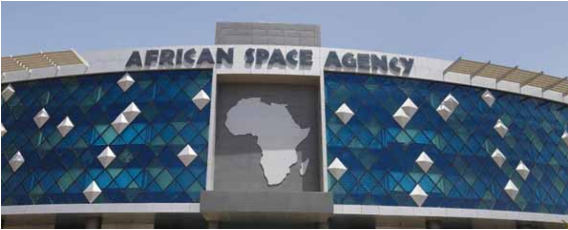
CAIRO - The headquarters of the African Space Agency in Egyptia Space City. The building was inaugurated on Sunday in Egypt.