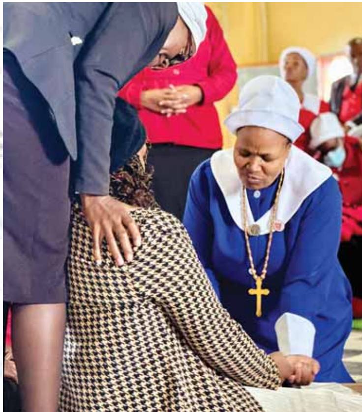
Methodist Church of Southern Africa Lobatse Circuit 1539, held an Easter service in Pitsane on Good Friday, bringing together congregants from Lobatse, Gaborone and Tsabong to reflect on the crucifixion of Jesus Christ.