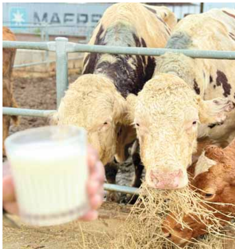
The smart milking technology produces frothy fresh milk which is then stored in tanks for daily deliveries.

stock. "If we increase animal head we will need sufficient feed rations. We are exploring ways of going into contract farming with farmers to be able to manage what animals feed on," said Mr Bareki. He expressed optimism at going into Phase II of the project upon completion of phase I which he noted would entail construction of four cow houses to be able to carry about 3 000 dairy cows to operate at full capacity to be able to supply sufficient milk to the nation. BOPA