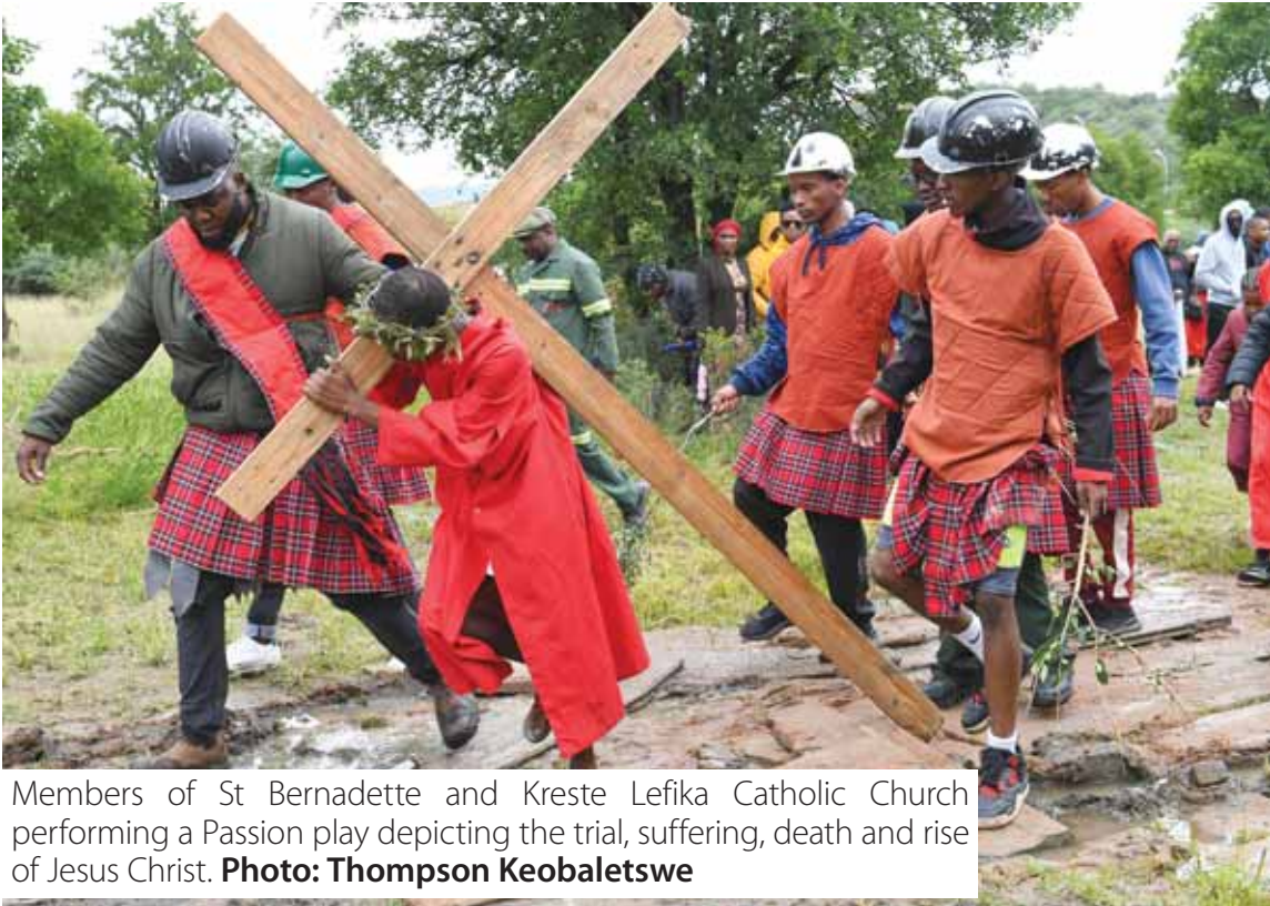
Members of St Bernadette and Krete Lefika Catholic Church performing a Passion play depicting the trial, suffering, death and rise of Jesus Christ.