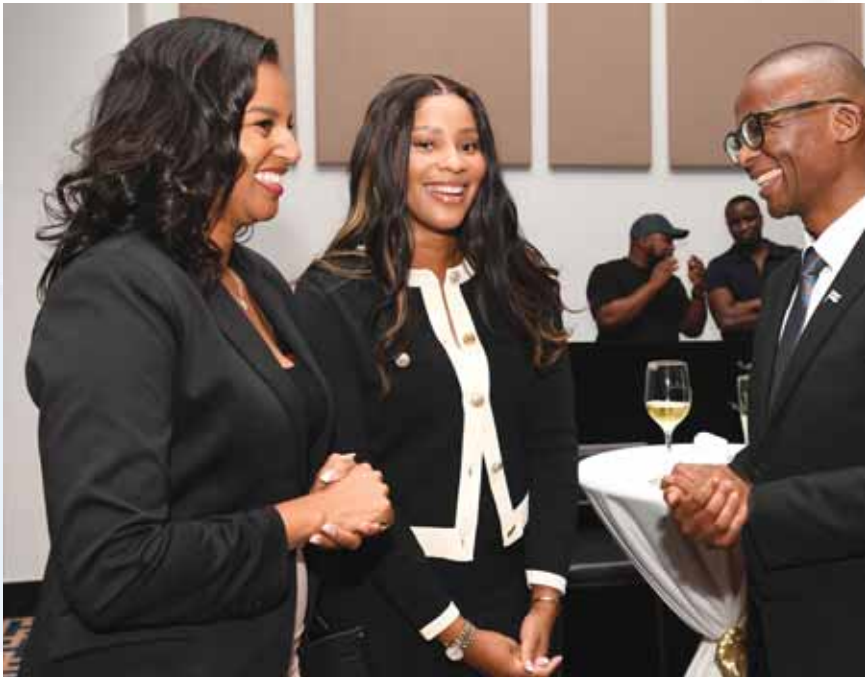
Vice President Ndaba Gaolathe (right) interacting with guests during the Africa Development Bank 60 th anniversary celebration in Gaborone.