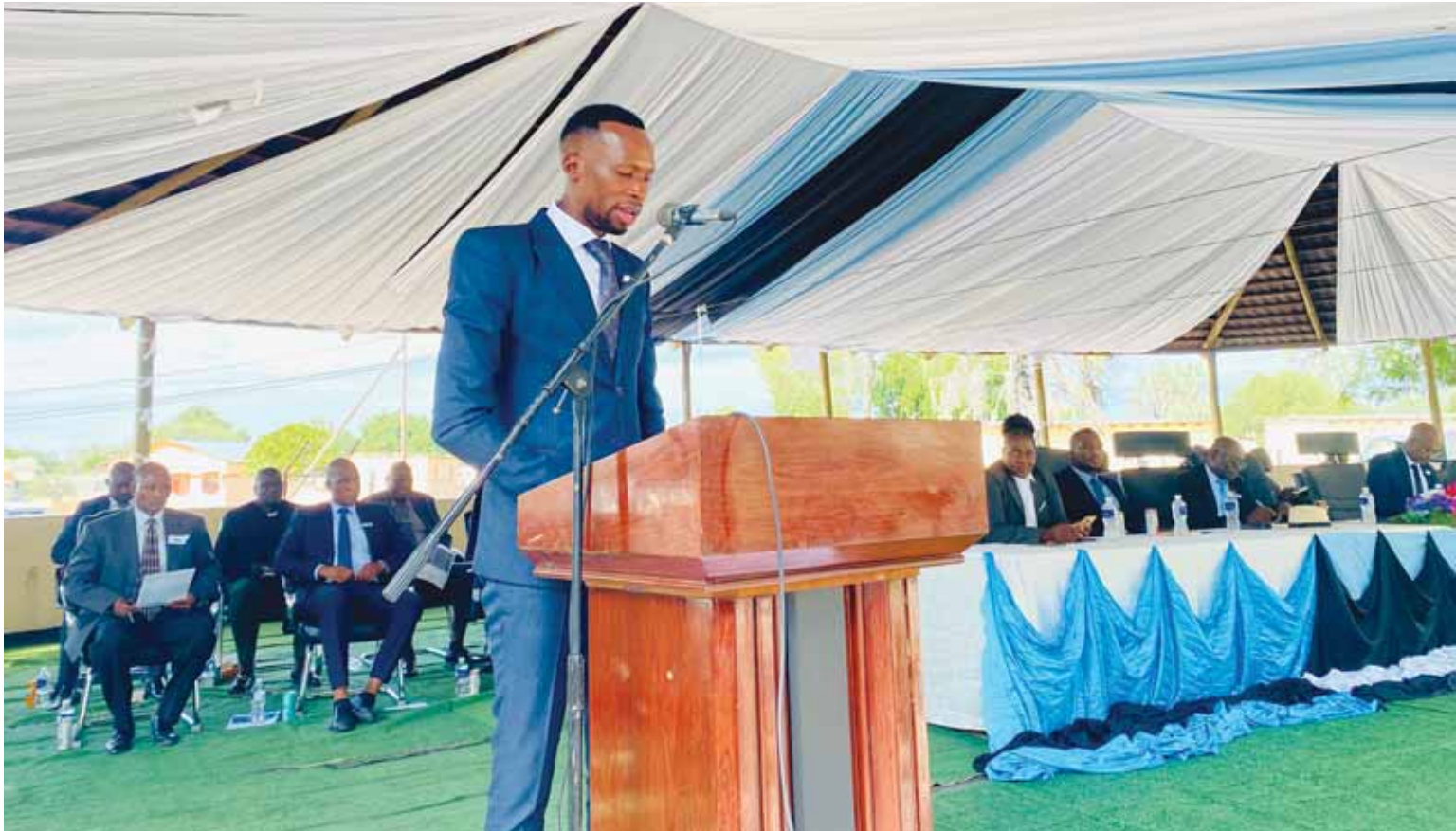
Assistant Minister of Health Mr Lawrence Ookeditse addressing Gumare residents on the Malaria outbreak in Okavango District recently. As at April 17, the Okavango District has reported the highest number of Malaria cases in the country, with a total of 1 400 out of 1 968 confirmed countrywide.

The MP underscored that the rebranding from landlocked to land-linked was more than symbolic as it reflected a broader strategic direction in national policy. Mr Gaolathe further said Botswana was increasingly investing in infrastructure, promoting regional integration, and modernising logistics and transport networks. Among key government initiatives, he mentioned plans to construct a major underground fuel pipeline and development of a new international airport to boost regional connectivity. He said such mega infrastructure projects would enhance the country's logistical capabilities and create business opportunities and jobs for citizens. He encouraged Batswana to contribute ideas and take initiative in developing ventures that supported the nation's economic transformation. Mr Gaolathe who is also the Vice President and Minister of Finance, said land-linked reflected, "Botswana is a connected, capable, and competitive nation," urging that Batswana should assume that position, and step confidently into a future of regional and global relevance. BOPA