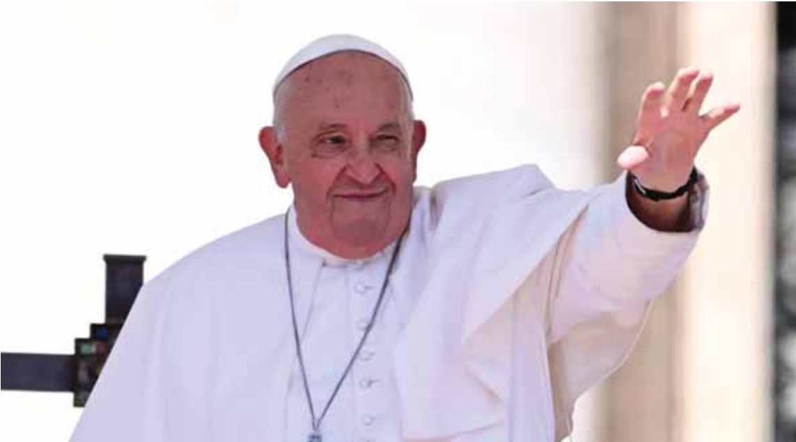
ROME - Pope Francis, the 266 th pontiff of the Roman Catholic Church, died yesterday at the age of 88, said the Vatican in a statement. Born Jorge Mario Bergoglio on December 17, 1936, in Buenos Aires, Francis was head of the Roman Catholic Church since 2013. His death came weeks after returning home from a 38-day stay in intensive care, and followed an intense Holy Week schedule that included public appearances. After a period of mourning, the Vatican will turn toward preparations for a gathering of the College of Cardinals to select Francis' successor.