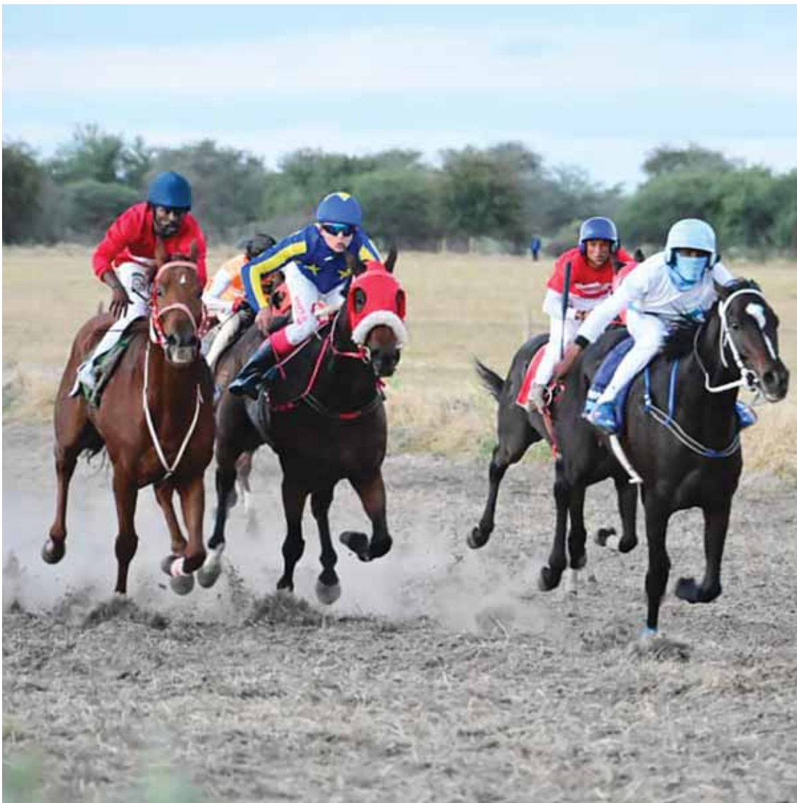
Western Bypass (right) from Motokwe was crowned the champion of the 2 400 metre grand race at the Masa Horse Race in Samedupi over the long weekend.