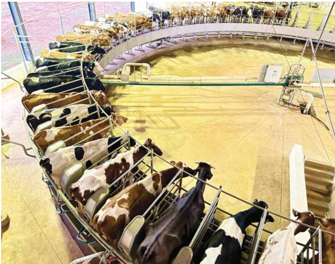
The dairy cows at the milking machine which entails teat cups, vacuum pumps, milk lines, milk receptacles, and systems for cleaning and sanitising the equipment.