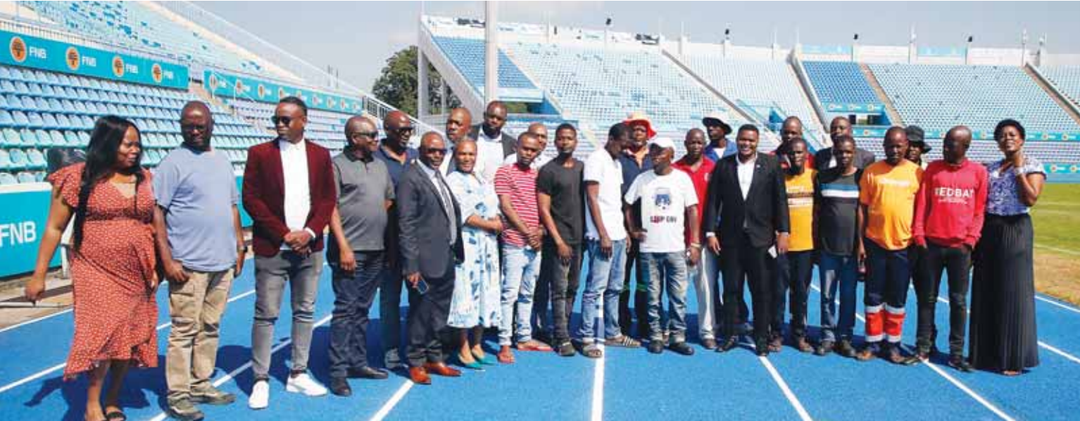
Minister of Sport and Arts, Jacob Kelebeng (sixth right) with the team that worked tirelessly through sleepless nights to ensure that the National Stadium track project was delivered on time. The minister said he found it fitting to acknowledge the workers for demonstrating true patriotism.

"We are Batswana as well and had anything failed, we knew the responsibility would be on us, hence we had to remain calm and complete the track," he said.