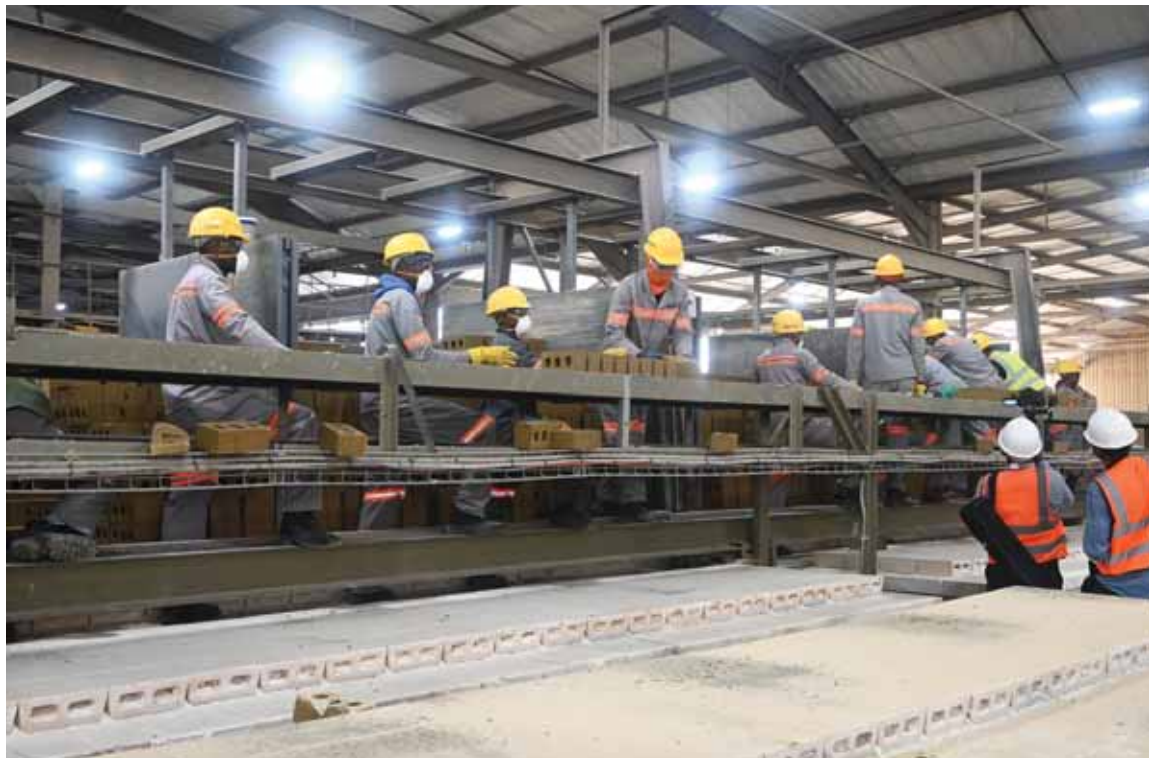
Lobatse Clay Works (LCW) employees on-site during a visit by AfDB executive directors on Monday. The LCW is a highly industrialised plant dealing in the production of clay bricks for both local and regional markets. The plant is amongst those funded by AfDB in partnership with Botswana Development Corporation at roughly P198 million.