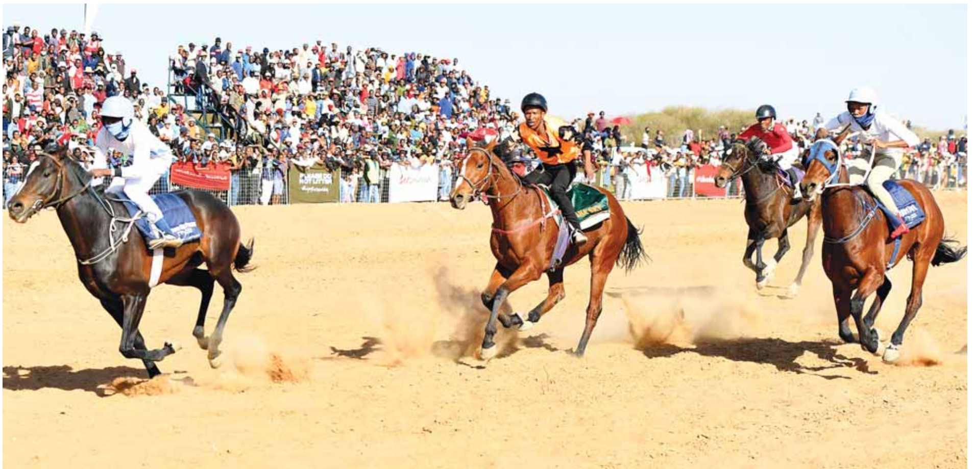
The Easter Holidays Horse Race billed for Masa racing farm situated at Samedupi settlement has attracted over 100 horses from Botswana, Namibia, Lesotho and South Africa to compete in different races ranging from 100m to 2 400m categories.