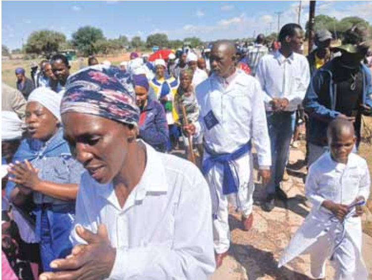
Churches in Omawenenno came together on Sunday to pray for issues of national concern such as road accidents, drug abuse and gender-based violence.

willing to meet the government halfway in the construction of the road by providing gravel material which was available in their village. The area MP, Mr Kwapa, underscored the importance of the road, which he said would contribute towards development in the area and attract investors. He noted that the road would also motivate public transport operators to transport people to other areas. "The government is committed to ensuring that services arrive where people are located, wherever they are in Botswana. Construction of this road would not only ease movement but would also go a long way in attracting businesses to this area," he noted. BOPA