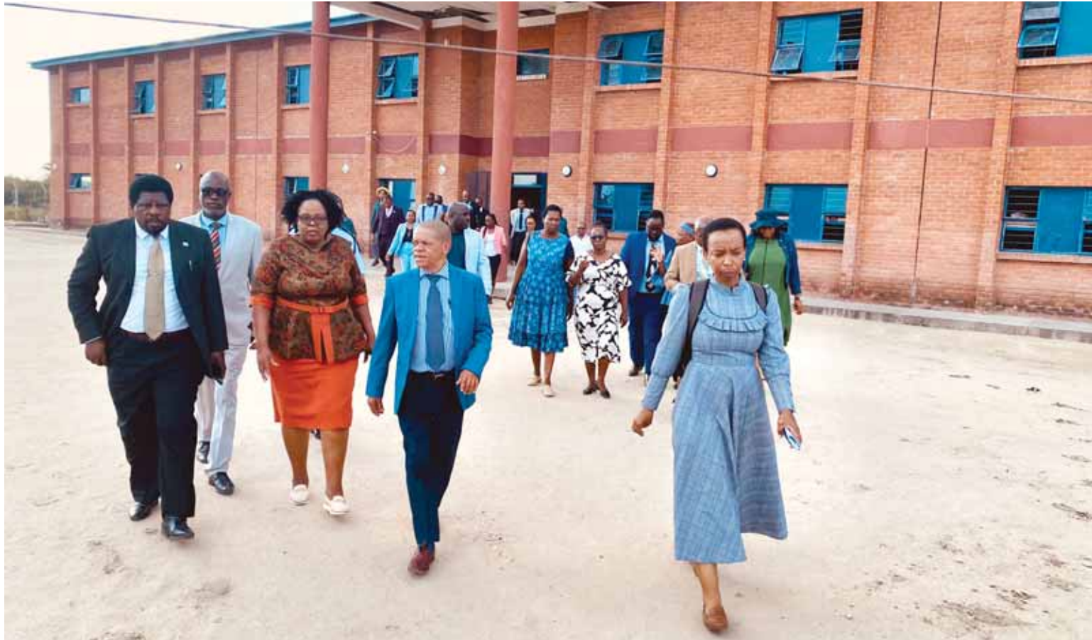
Minister of Child Welfare and Basic Education, Ms Nono Kgafela-Mokoka (third left) and other dignitaries during a tour of Gowa Junior Secondary School in Kauxwi, Okavango District on Monday. The minister expressed dismay at the poor state of the school.

He noted that the landboard did not have the powers to decide on the issue but could only act on the decision made by Cabinet.