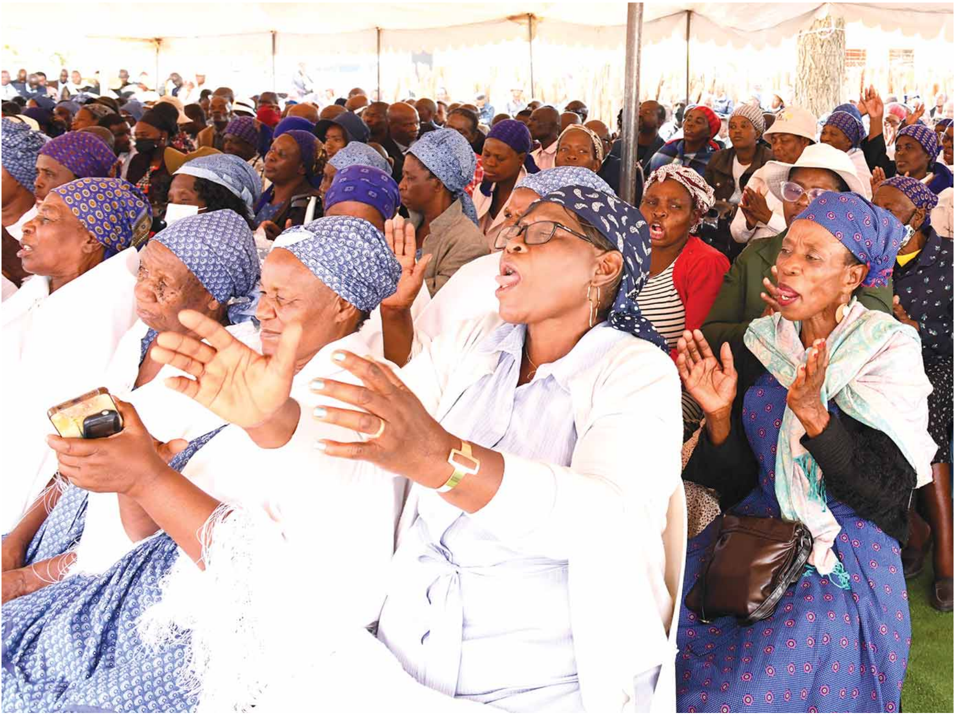
Residents of Kgagodi are filled with excitement following the restoration of a 10 by 10km area (10 000 hectares) land belonging to the community. Addressing a kgotla meeting in Kgagodi yesterday, President Advocate Duma Boko reaffirmed that the land was rightful property of Kgagodi residents under Customary Land tenure. He said the compulsory acquisition of the land, which was executed through a Presidential Directive in 2023 was done without adequate consultation.

compulsory acquisition of the land, which was executed through a Presidential Directive in 2023 without adequate consultation. Cont...page 3