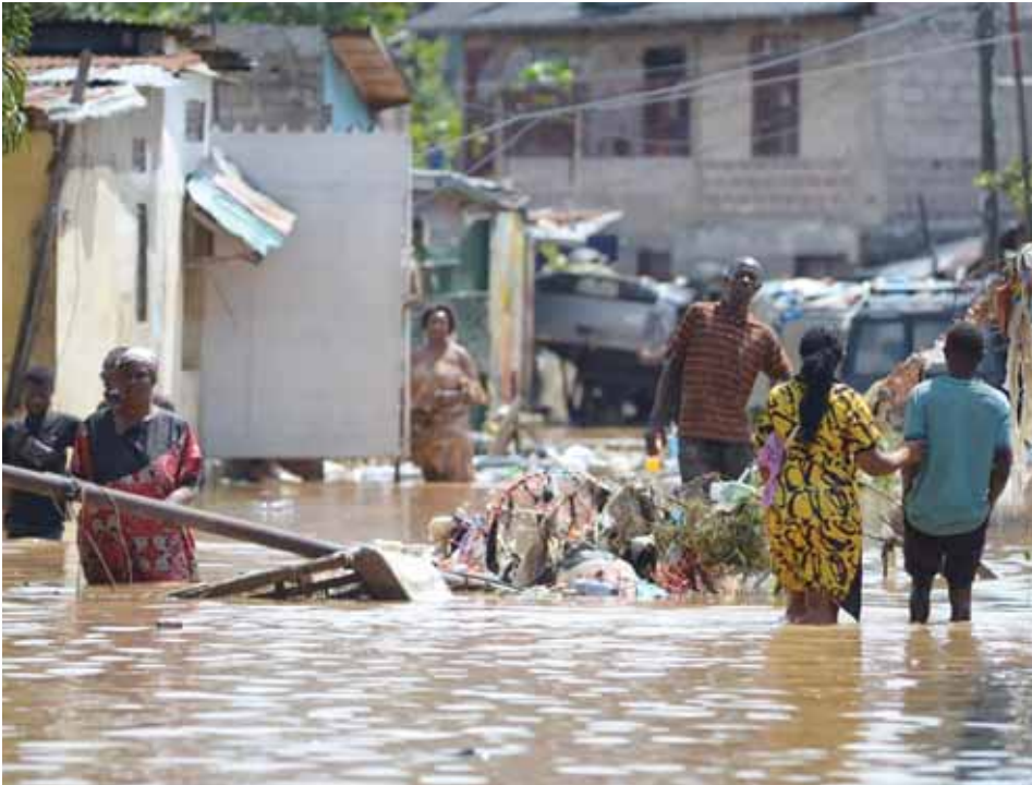
KINSHASA - Heavy rainfall and widespread flooding have affected multiple provinces in the Democratic Republic of the Congo, with Kinshasa facing some of the severe impacts.

both health and humanitarian emergencies. Continued heavy rainfall has been forecast for the coming days, raising fears of further destruction in the city of 17 million, already vulnerable due to rapid and unregulated urban expansion. DRC rainy season typically runs from November through May. Xinhua