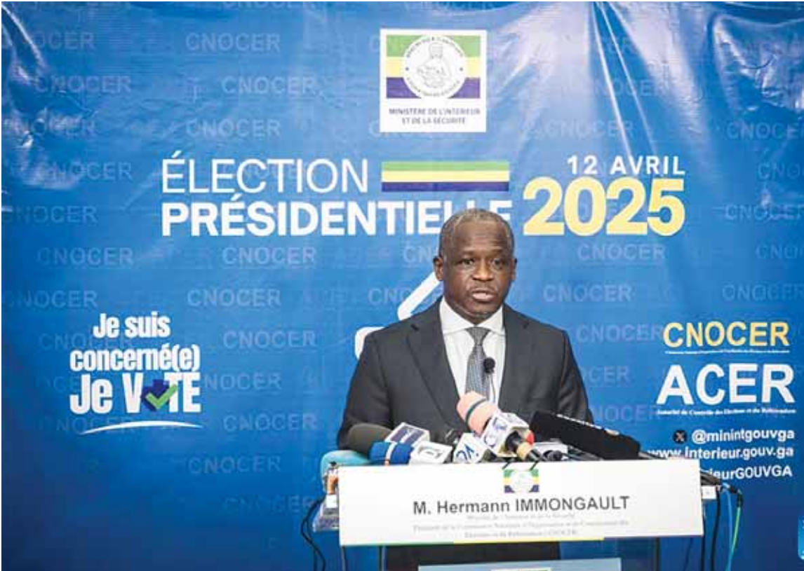
LIBREVILLE - Gabon Interior Minister Hermann Immongault declaring the results of the 2025 presidential election during a press conference on Sunday. Gabon's transitional leader Brice Clotaire Oligui Nguema has been elected president following Saturday's vote.

months, hailing it as a symbol of self-reliance and collective effort amid economic pressures. Upon completion, the GERD will have a total generating capacity of 5 150 megawatts and was expected to produce 15 760 GWH of electricity annually, according to Ethiopia Electric Power. Construction of the GERD began on the Nile River in April 2011. The project has been a longstanding source of tension between Ethiopia and downstream countries Sudan and Egypt. While Ethiopia views the dam as central to its development ambitions and pursuit of lower-middle-income status, Egypt and Sudan have voiced concerns over potential impacts on their water security. Xinhua