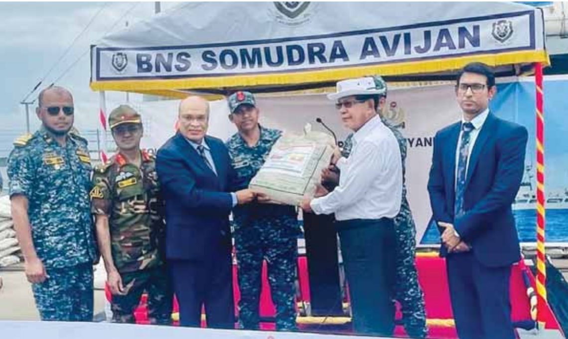
YANGON - Bangladesh Embassy handing over another consignment of humanitarian relief material from the government of Bangladesh to support those affected by the recent earthquake in Myanmar. The donation was handed over on Saturday.