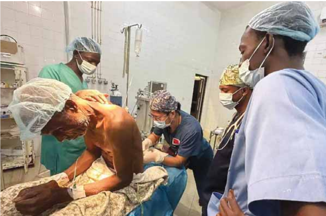
BANJUL - A member of the 22 nd batch of the Chinese medical team in The Gambia administering anesthesia on a patient at the Farafenni General Hospital in the North Bank Division on Thursday. The Chinese medical team conducted an outreach clinic and medical supplies donation event on Friday. The event, which began on April 7, covered multiple specialties including gynaecology, paediatric surgery, orthopedic trauma, and traditional Chinese medicine. A total of 21 surgeries, mainly general and paediatric, were performed, while over 300 patients received treatment and consultations.