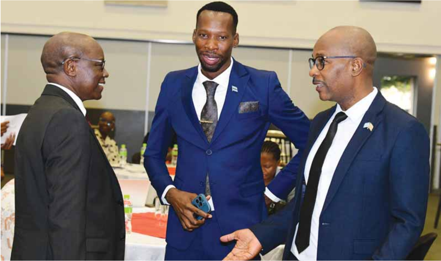
Member of Parliament for Tswapong South, Dr Kesitegile Gobotswang (left), acting Minister of Health, Mr Lawrence Ookeditse (centre) and Parliament Committee on Health and HIV/AIDS chairperson, also MP for Ngami, Mr Phillimon Aaron during the National Parliamentary TB caucus launch in Gaborone on Thursday. Mr Ookeditse said Botswana registered 3 251 TB cases in the year 2023, while World Health Organization estimates indicated that Botswana was still missing half of its TB cases owing to programmatic and operational gaps in case finding, diagnostics and supply chain management.

She also emphasised the need to embrace digitalisation, saying it had become crucial in today’s paced, technology-driven world. She added that it was also a means to enhance effective and efficiency in service delivery.