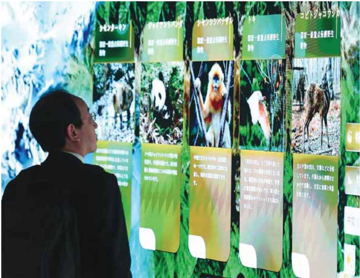
OSAKA - A visitor touring the China Pavilion at the Osaka Expo in Japan yesterday. The expo was officially opened in front of the pavilion's main building, which is designed to resemble a traditional Chinese scroll. Inspired by traditional Chinese calligraphy scrolls, the pavilion's architectural design embodies the theme of: Building a Community of Life for Man and Nature Future Society of Green Development. The expo will end on October 13.

be penalised. The new penalty system is geared to curb the abuse of the Nigerian visa, and travellers who stay beyond three months will face a five-year ban while others who stayed for a year or more after the expiration of their visas would be banned for 10 years, he said. It is part of a broader effort to guarantee compliance, promote responsible migration, and protect national security, the minister said, adding that the Nigeria Immigration Service has been empowered to enforce the penalties. Xinhua