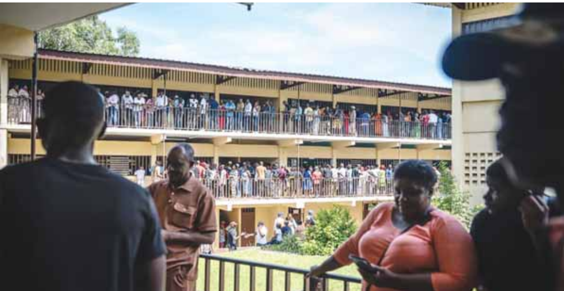
LIBREVILLE - Citizens queuing to vote at a polling station in Gabon on Saturday. Gabonese voters went to the polls to elect a president in its first presidential election since a coup two years ago, marking the final phase of the country's political transition and the anticipated return to constitutional order. The Ministry of the Interior said there were 3 037 polling stations, including 2 941 within the country and 96 abroad. A total of 920 200 voters registered, including over 28 000 overseas.