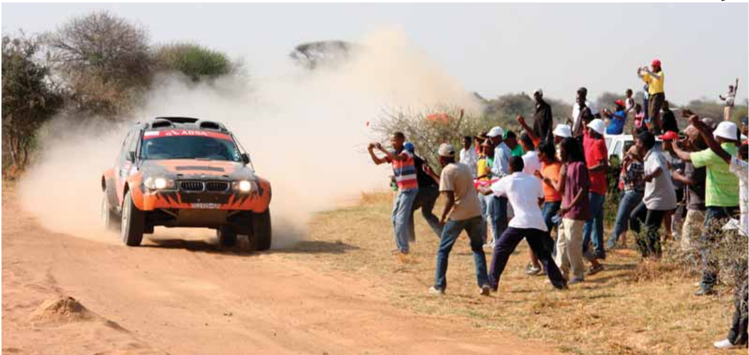
Over 50 off-road vehicles and motor bikes are expected to participate at the Sarona Kalahari Desert Race scheduled for Jwaneng on Saturday.