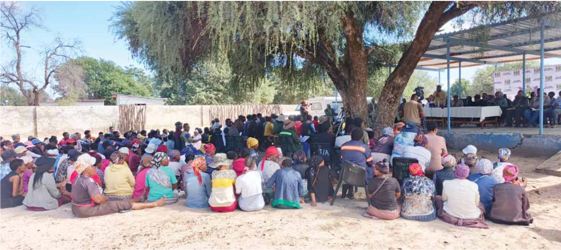
New Xade residents during a consultative meeting yesterday with the Inter Ministerial Committee that President Advocate Duma Boko appointed to comprehensively look into the situation of Basarwa in Botswana. The residents who moved to the place in 1997, have pleaded with the government to return them to their ancestral place, the Central Kalahari Game Reserve. They promised that if their plea could be acceded to, they would not scatter, but remain in a designated area that government would prescribe and service.