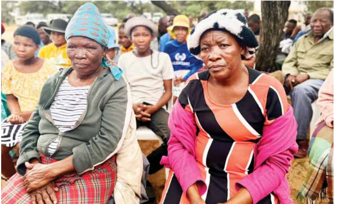
Banni ba Ranyane kwa phuthengong e e neng e buisiwa bosheng ke lekoko le le tlhomilweng ke Tautona go rerisanya le Basarwa ka ditlhabololo tse di ba amang.