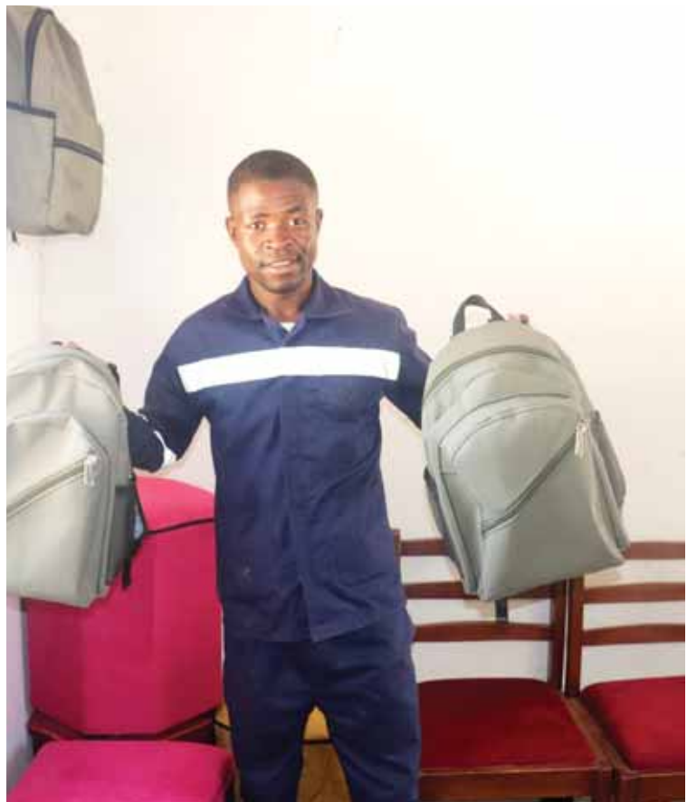
Mr Meshack's expertise spans a wide range of products including sleigh frames, headboards, kists, ottomans, pedestals, canvas bags, car interiors, sofas, tents and assortments of canvas products.

An upholsterer covers furniture frames with padding and fabric or leather to make beds, mattresses, chairs, sofas and car seats. BOPA