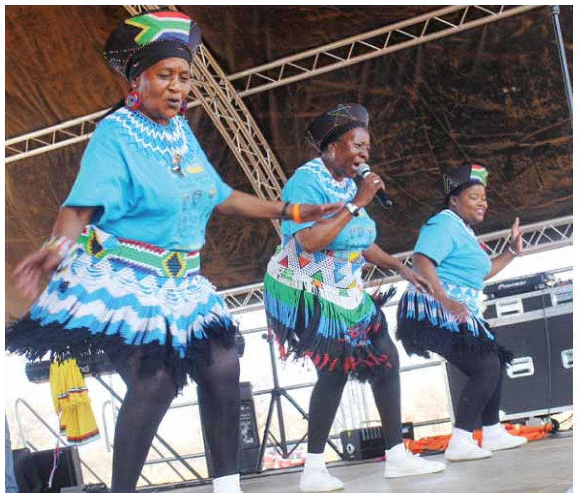
The legendary Mpaxanga band from South Africa, Mahotella Queens will be among performers to headline the seventh African Attire On Fleek picnic scheduled Saturday at Bojanala Waterfront.