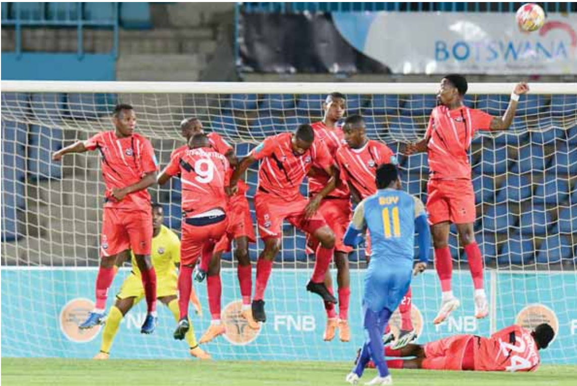
Jwaneng Galaxy and Township Rollers battling it out. The race to win the FNB Premiership title has intensified for the top four teams, TAFIC FC, Jwaneng Galaxy, Gaborone United and Township Rollers. Currently as the log stands, all the four teams are on 42 points, separated by goal differences.

As for Security Systems, it is going to be a tough one as they suffered a 2-0 loss in their last match with Gaborone United. BOPA