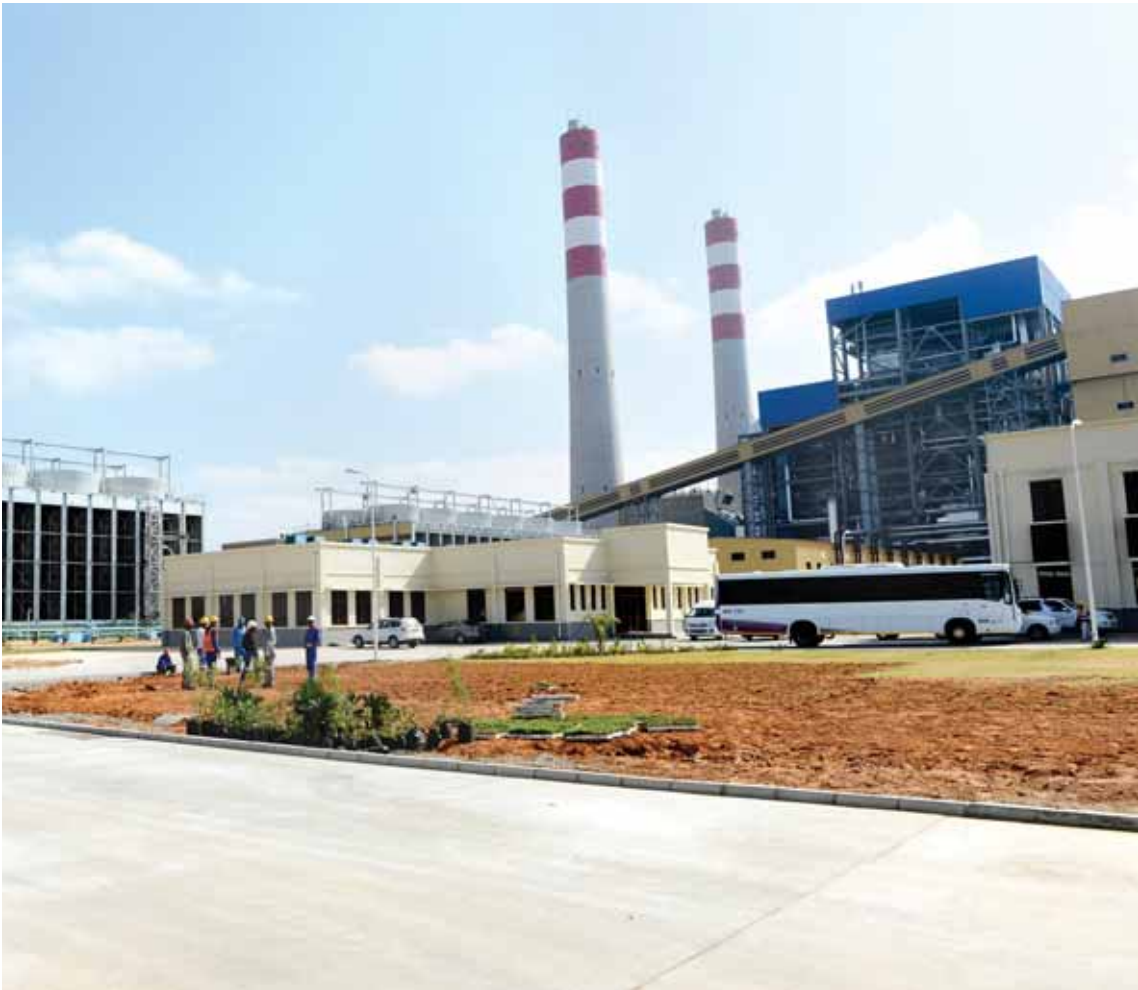
Botswana Power Corporation has restored one of the power generating units (Unit 4) at Morupule B Power Station.

However, the public notice says stability is expected by June 2025 with three units (unit 1, 2 and 4) expected to be fully operational at Morupule B, barring any unforeseen circumstances, says the public notice. BOPA