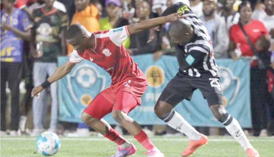
Pegged at position six on the log standing, Mochudi Centre Chiefs will be welcomed by Sua Flamingoes at the Sowa Town Council Stadium while Tatic FC which tops the log is expected to host relegation candidates Chadibe FC on Saturday.