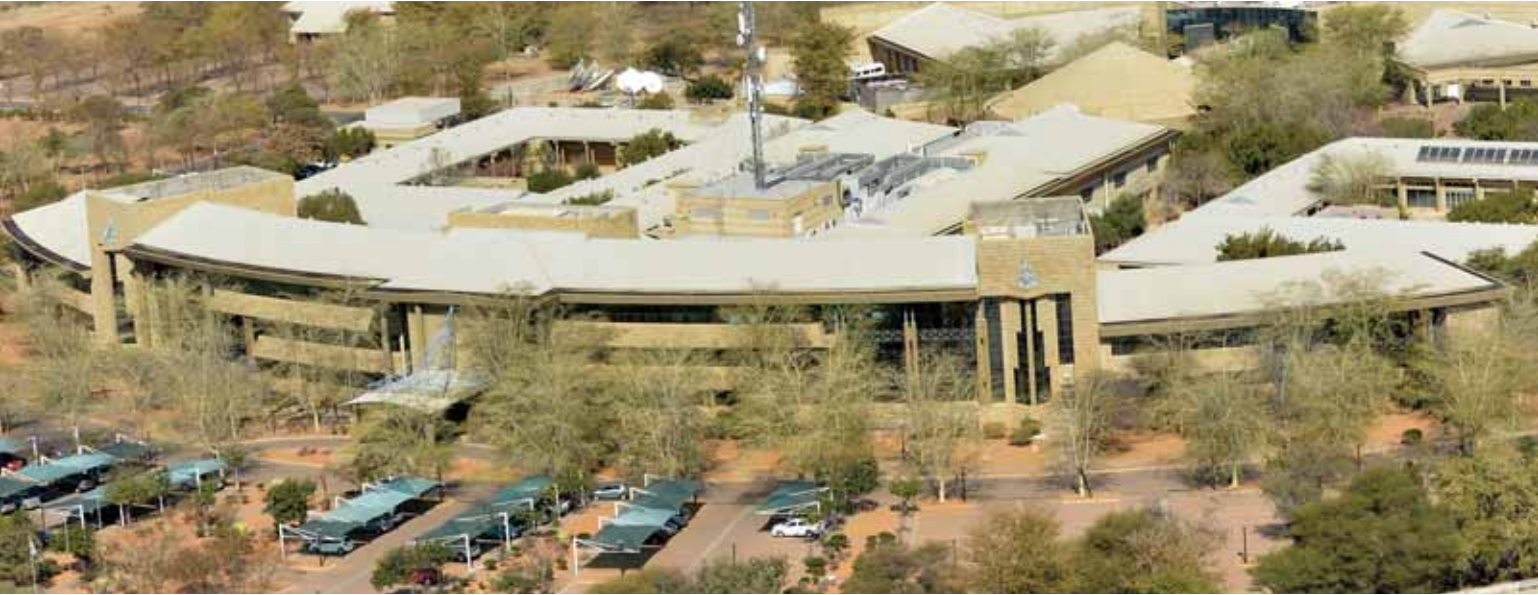
Minister for International Relations, Dr Pheny Butale has told Parliament that work was in progress to transform the state media into a public broadcaster with an autonomous board.