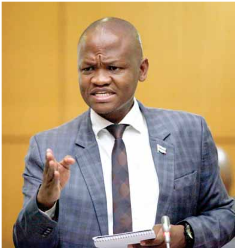
Acting Minister of Lands and Agriculture, Dr Edwin Dikoloti said the adoption of the policy on the lawful use of cannabis in Botswana for industrial and medicinal purposes was a positive step that was due to assist the country create jobs and diversify revenue streams.