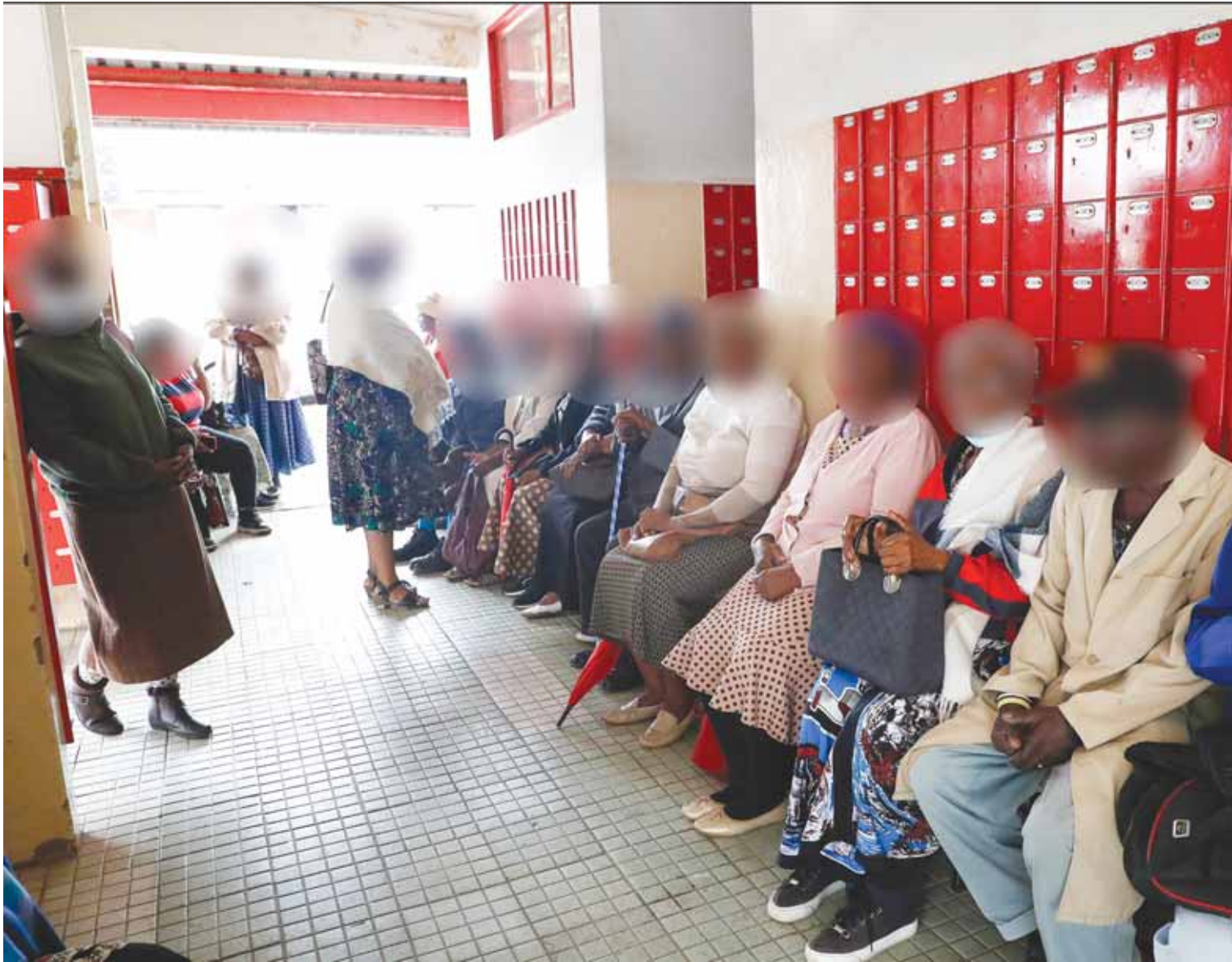
Old age pensioners queuing at a post office in Gaborone yesterday to receive their monthly allowance commonly known as Tandabala, which was increased from P830 to P1 400 effective April 1. The increment was announced by Vice President and Minister of Finance, Mr Ndaba Gaolathe in his 2025/26 budget speech in February. While they welcomed the increment, some pensioners in Gaborone expressed frustrations about queuing for long hours, with some saying their social benefits cards were not functioning properly. The allowance meant for citizen aged 65 and above, aims to help senior citizens live a more dignified life.