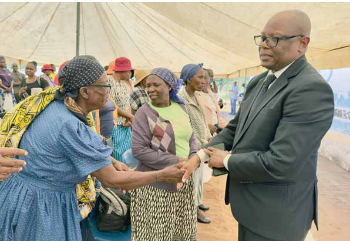
Minister of Environment and Tourism, Mr Wynter Mmolotsi (left) interacting with elders after a Kgotla meeting in Kazungula on Tuesday. The minister implored community trusts to uphold highest standards of governance and accountability in managing public funds.

Minister Mohwasa, who is accompanied by government officials is expected back home on Saturday. BOPA